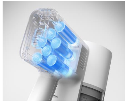
Ultra-long battery life