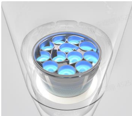
12-cone dust-air separation