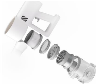
99.9% high-efficiency filtering