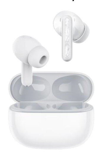
Moonlight White BHR7662GL, 50140