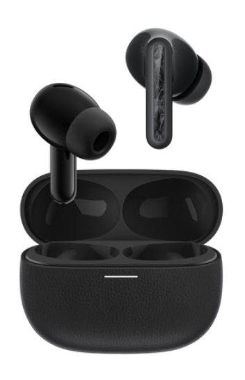
Midnight Black BHR7660GL, 50138