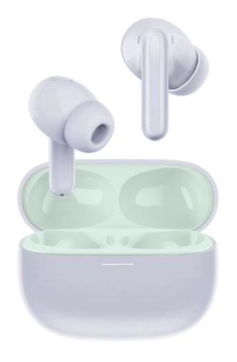
Aurora Purple BHR7799GL, 50977